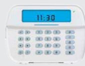
DSC Alarm Panels